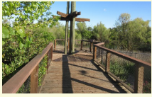
Northstar Park ponds side trip

6.2 miles of paths (including side trips), starting and ending in Community Park